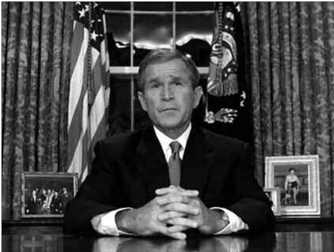
George Bush during the first official communication on 11-S attack

Everything indicates that this New Pearl Harbor was the 9-11 attack which, as we will see later on, a great number of people had anticipated. The founder of the Red Voltaire web page, Frenchman Thierry Meyssan, was first in the world who dared defy the official version, backed up by endless repetitions of airplanes crashing into the towers. He was the pioneer who first analysed the hole left