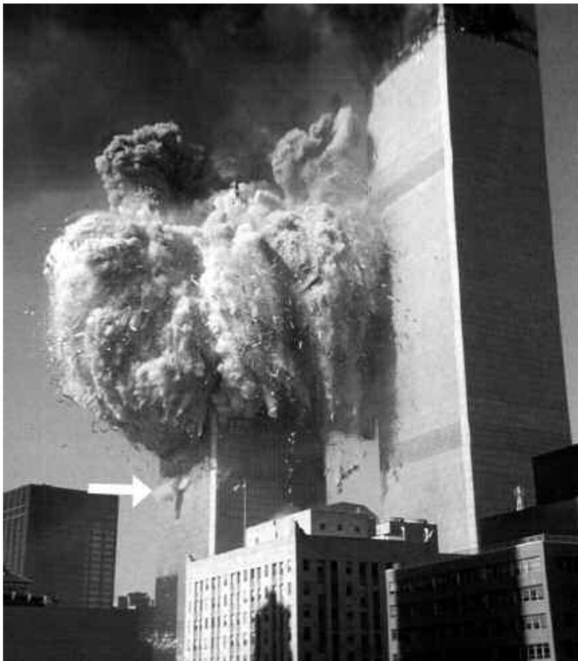
The arrow points to one of the explosions on a floor below the collapsing area of the building and evidences controlled demolition.

The world government ordered the viruses to decimate the population