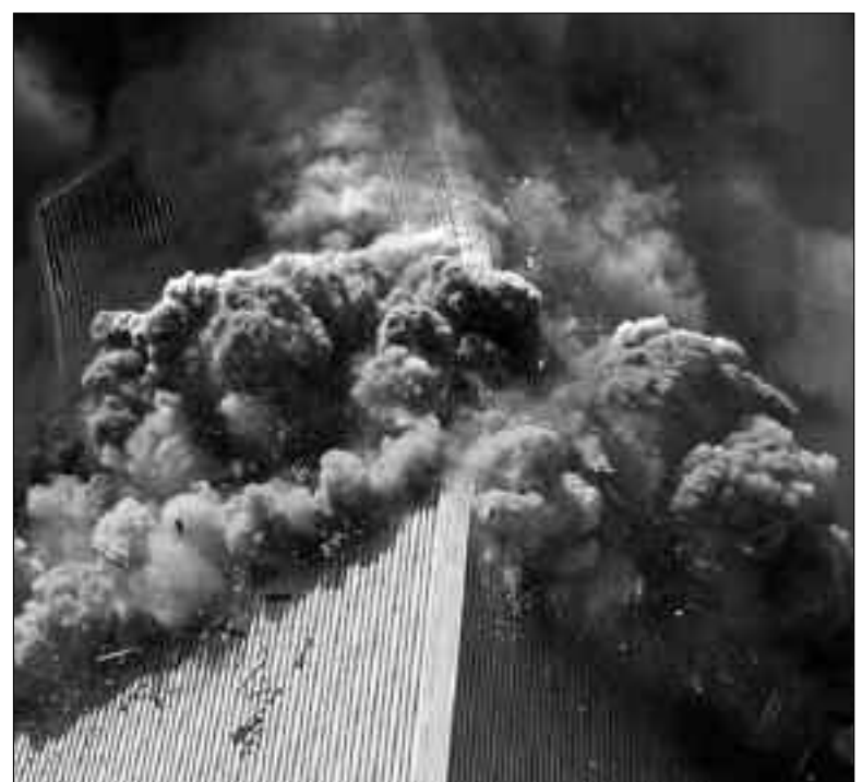
The explosions of the controlled demolition hurled materials from the cladding and the structure dozens of meters outwards.

The terrorists not only succeeded in avoiding detection despite all this intelligence and thanks to State negligence (or intelligence) but successfully passed the control points in possession of knife/like weapons (according to the official version), used their passports (and no one refused to stamp them despite their names being on FBI lists) and then proceeded to take over the aircraft. With results given on our collective memories. •